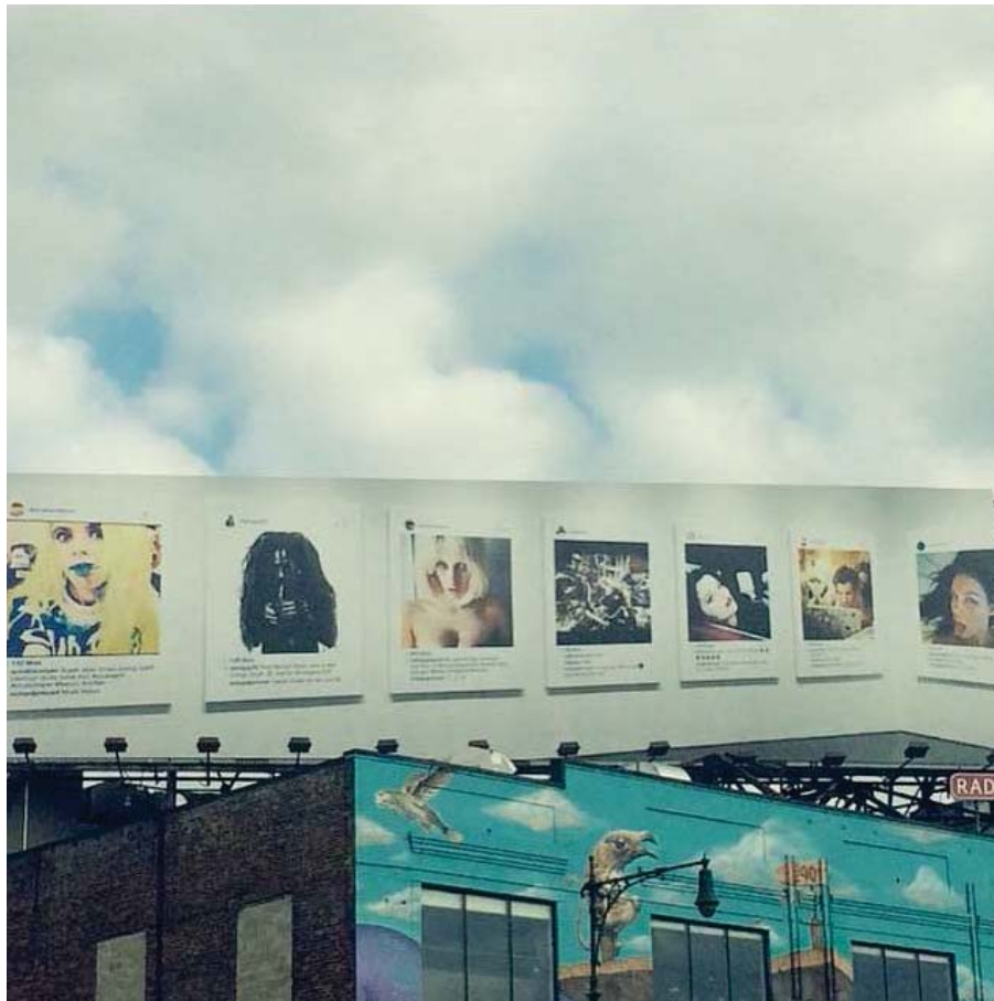
The Billboard (Fig. 3)

whether it was erected before the New Portraits exhibition closed in October 2014.