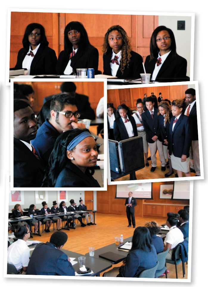
St. Louis Internship Program (SLIP)